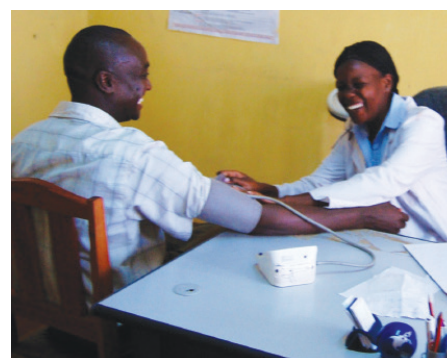
E-HEALTH CORNERS: Kenya National Library Service's e-health corners support local health service provision.

The two branch libraries are now recognized as vital links in the chain of health information provision. Working with the Ministry of Public Health and Sanitation, the two libraries host public lectures on health issues. KNLS is also starting e-health information points in rural clinics to improve health workers' access to information.