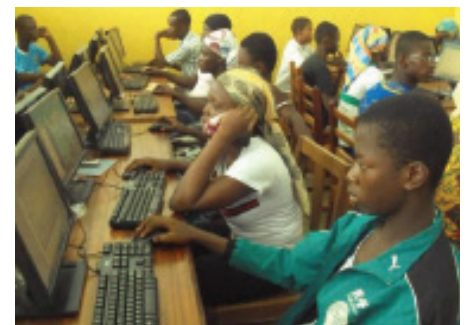
YOUNG LEADERS: ICT and leadership skills training in Northern Regional Library is helping build young people's technology, confidence and communication skills.

part time to raise money for further study. The library is now a recognized player in local development, hosting monthly public lectures and debates to deepen understanding about the value of ICT in addressing community needs in areas like health, the local economy, women's empowerment and education.