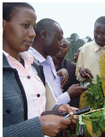
HEALTHY PLANTS: The library's smart phone service enables farmers to send SMS messages to plant experts to ask for advice about combating plant pests and diseases.

They use the smart phones to take photographs of diseased plants, and send them to experts who identify problems and offer solutions via email or mobile phone text messages (SMS). The service also trained over 112 farmers and other community members to use computers, and set up a web-portal for farmers with links to agricultural information and support agencies.