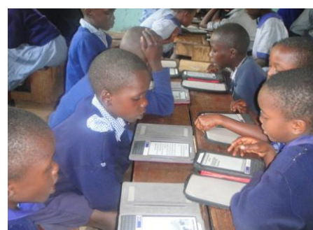
READING ALOUD: Children at Menara Primary School practise reading aloud in class, using e-readers provided by ‘Dr Robert Ouko’ Memorial Community Library.