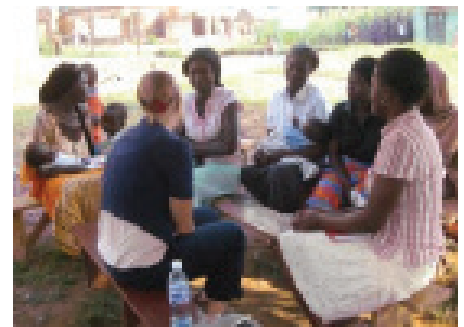
INFORMATION FLOWS: The library's health service helps improve communication between health workers and people living in remote rural villages.

workers and schoolchildren distribute in remote villages. Guided by health workers, the children also perform short plays to promote healthy lifestyles. As a result of the project, the library developed a partnership with the local non-governmental organization, A Little Bit of Hope, which has built pit latrines for 30 households in two villages, and is helping disseminate the library's messages about sanitation, nutrition and hygiene.