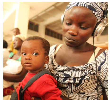
MATERNAL HEALTH: In the library, women watch videos about what to expect during childbirth on computers pre-loaded with maternal health information.

education campaign on local radio stations to reach non-literate women. For health workers, the library set up a maternal health corner with free access to five computers pre-loaded with maternal health information. They trained 15 health workers to use the computers, to conduct online research and to access the pre-loaded material. In 2013, Savana Signatures received funding (over US$200,000) to expand this successful service to include four more districts and translate SMS into local languages.