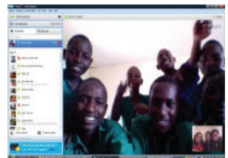
NEW FRIENDS: Children from Good Samaritan School for the Deaf use the online communication tool Skype to communicate with new friends in Canada.

know sign language, and even within their own families, deaf children may be regarded as mentally retarded. Now, about 20 students from Good Samaritan visit the library every week. To help overcome prejudice, the library also works with family members, schools and local institutions like hospitals and the police service. In 2013, the service won an EIFL Public Library Innovation Award for library services contributing to social inclusion in the community.