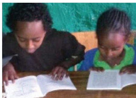
FAMILY LITERACY: Three rural libraries are creating e-books for pre-school children and organizing family literacy classes where parents can read with their children.

CODE-Ethiopia, which is leading the project. CODE-Ethiopia will publish 12 new e-books for pre-school children; of these, six will be written by local librarians and based on community life and customs. Librarians are also being trained to offer regular family literacy sessions in which parents and children read together.