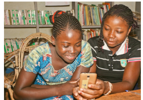
HEALTH CLUBS: Members of the Girls' Health Club at Dimikuy Village Library practise using smart phones to access the information and search for health information.