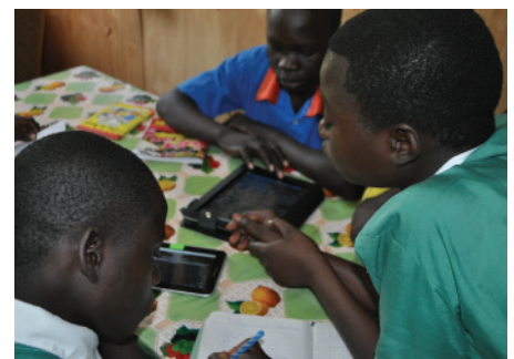
LEARNING FUN: Children use tablet computers at Busia Community Library to access educational content linked to the school curriculum and to play educational games.