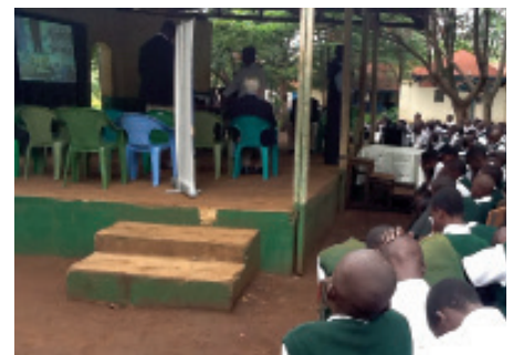
VIDEO CONFERENCE: Kisumu High School pupils take part in a multi-school video conference organized by the library. When large groups of children take part, schools use projectors to magnify images and speakers to amplify sound.