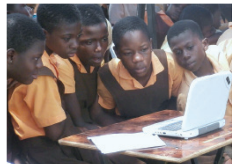
HANDS-ON: Children in rural schools that do not have computers or electricity get hands on experience through Volta Regional Library's mobile computer classes.

additional funding and technology support from the local technology agency, Ghana Investment Fund for Electronic Communication (GIFEC), which donated five desktop computers, additional solar panels, a canopy for outdoor lessons, desks and chairs. It also attracted over US$5,000 from individual donors through the online funding platform, GlobalGiving.