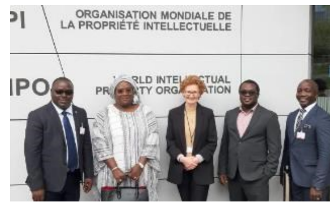
EIFL Team at SCCR/42