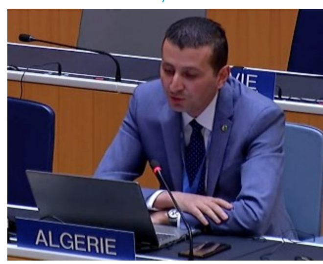
Algeria, Coordinator African Group