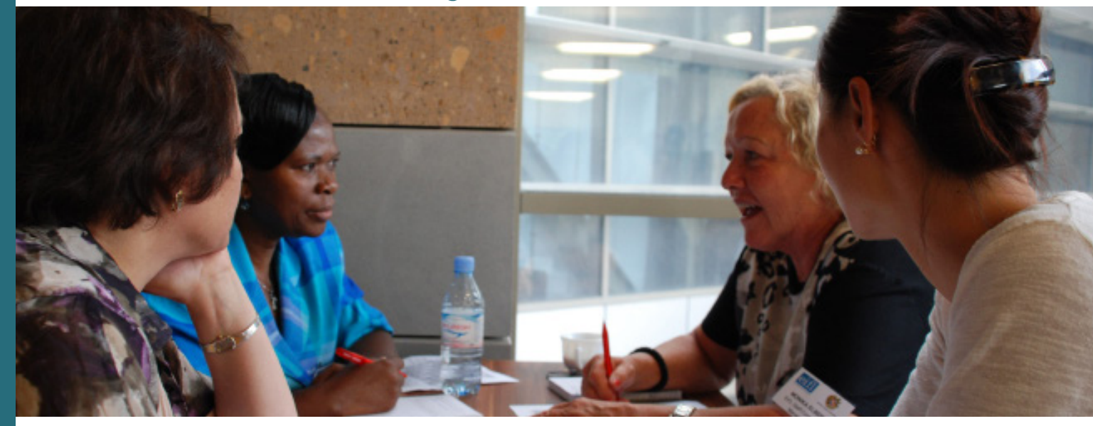
EIFL library consortia members (left) discuss issues and share knowledge with EIFL consortium management staff (right) at the 2012 EIFL General Assembly.