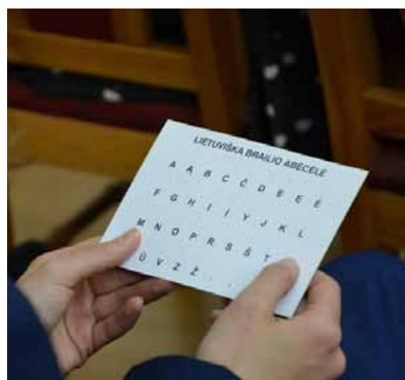
LITHUANIAN BRAILLE ALPHABET

The more uses that are permitted under the limitations and exceptions, the more comfort will be provided to those making and distributing accessible formats: in essence, empowering those providing access to persons with print disabilities. This is particularly important because a condition of receiving an accessible format copy across a national border (importing) is that the law of the receiving country must permit the production of that format under an exception. 30 Therefore the more types of accessible formats allowed under national law, the more legal certainty there is for a country importing accessible format copies made in another country.