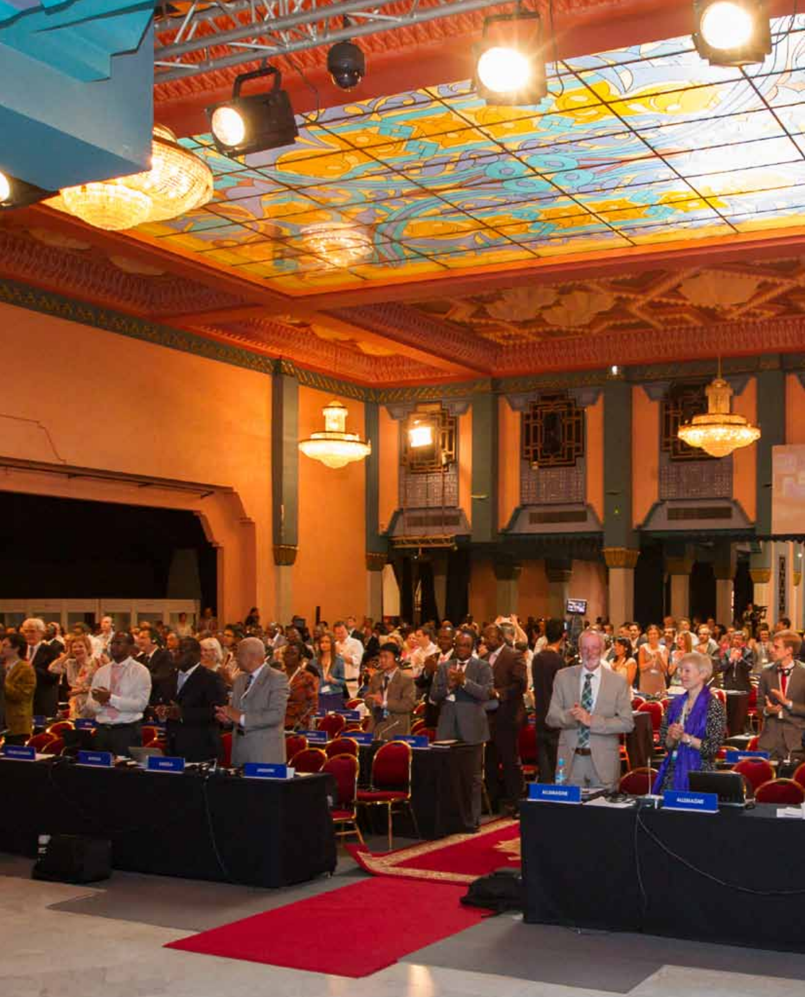
WIPO MEMBER STATES ADOPT THE MARRAKESH TREATY