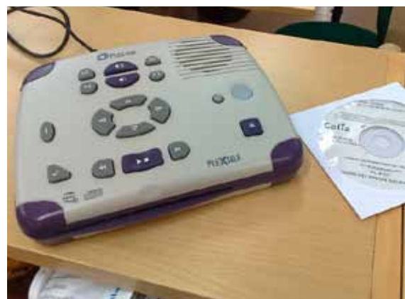
DAISY PLAYER AND AUDIO BOOK AT HELSINKI CITY LIBRARY

Accessible format copy Article 2(b) describes an “accessible format copy” as a copy of a work in a form which gives a beneficiary person “access as feasibly and comfortably as a person without visual impairment or other print disability.”