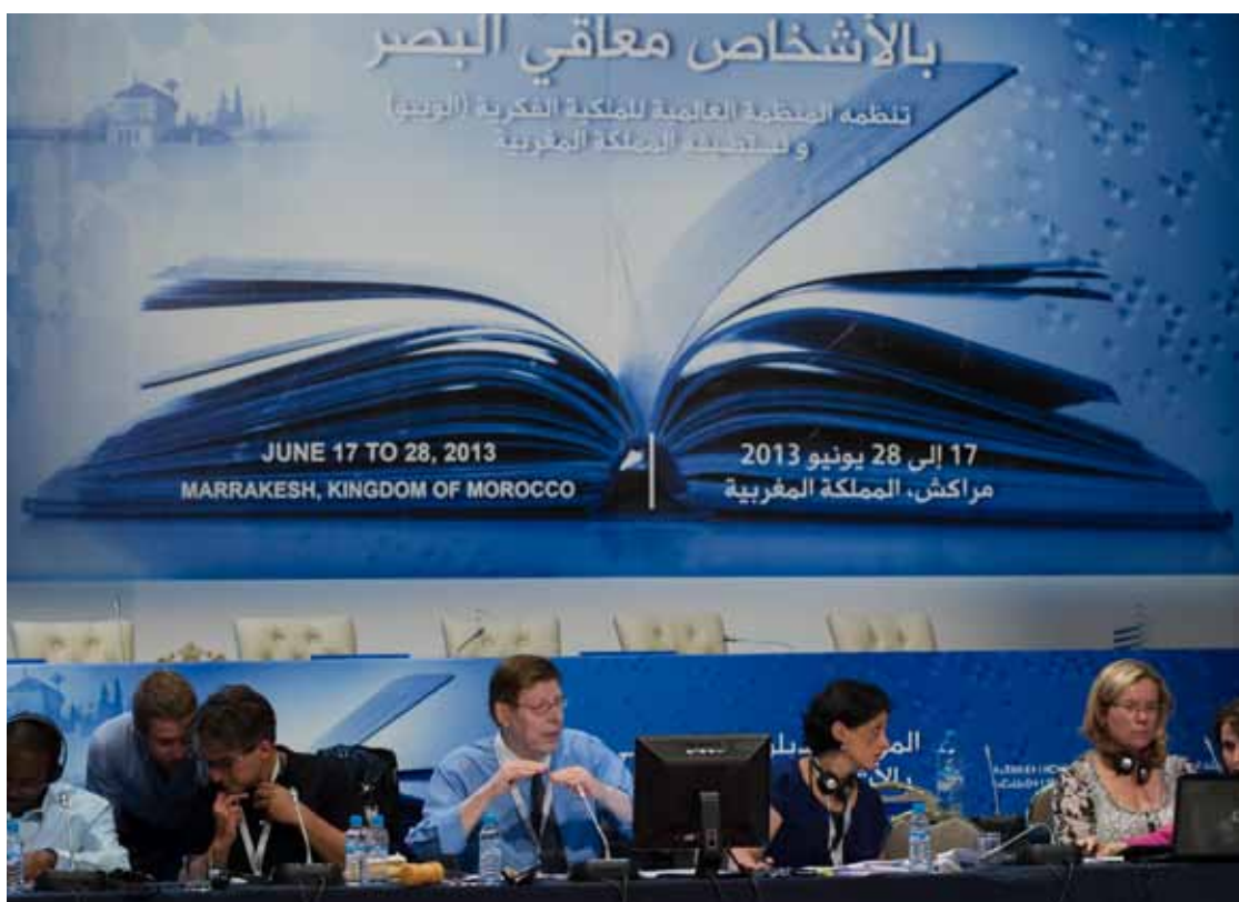
MARRAKESH NEGOTIATIONS. © WIPO 2013. PHOTO: EMMANUEL BERROD

mean that the library declines to offer the service at all. 12 Of course, if an accessible format copy is available on the commercial market, a library can always in any case decide to purchase such a copy.